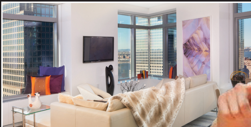
HOME GAME: Jeremy Lin rented a condo in the W Hotel downtown (above) for game days.