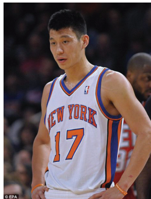
Need a rest? Good thing Jeremy Lin's got a Manhattan apartment now to make his commute time after games much shorter

'They're working to build a team to handle all this, and hiring marketing and P.R. executives. He has met with IMG.' Questions of endorsement deals and marketing teams are all new to Mr Lin, who famously was crashing on his brother's couch when he started to shine.