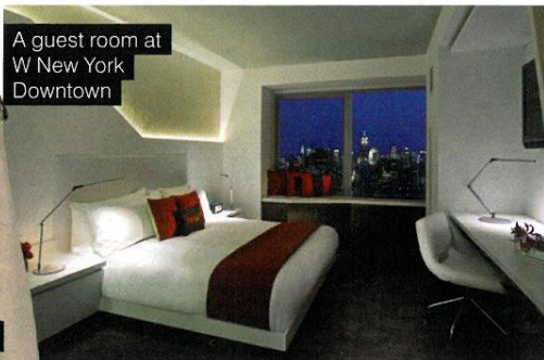
A guest room at W New York Downtown