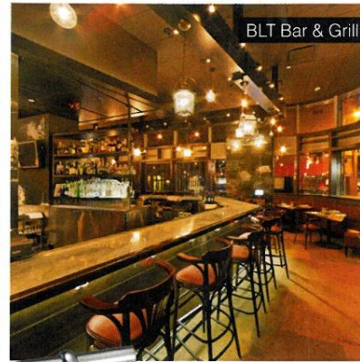
BLT Bar & Grill