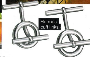
Hermès cuff links