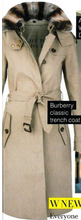
Burberry classic trench coat

A stay at one of these three luxe properties is the perfect way to start the New Year.